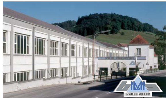
Böhler-Miller Messer u. Sägen GmbH, Böhlerwerk

Sales & Production Waidhofner Straße 11 A-3333 Böhlerwerk Austria T: +43 (0) 7442 / 601 - 0 F: +43 (0) 7442 / 601150 E-mail: info@bmms.at www.bmms.at